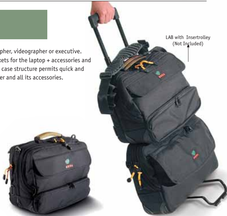
LAB with Insertrolley (Not Included)

The LAB is ideal for the digital photographer, videographer or executive. It has a padded partition and many pockets for the laptop + accessories and additional compartment for folders. The case structure permits quick and easy storage and removal of the computer and all its accessories.