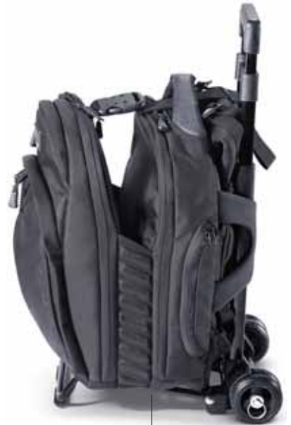
RL-302 with Insertrolley (not included)