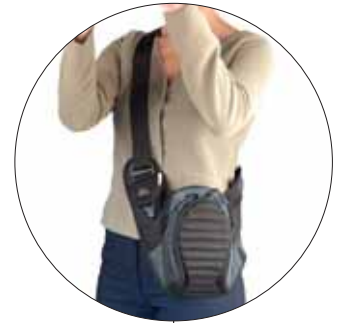
S-312 in Sling Configuration