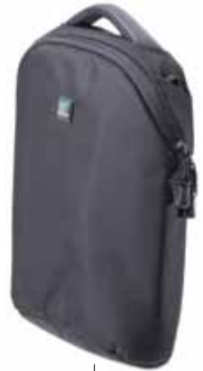
Laptop case included

2) A laptop slot is available inside the rear compartment. Large front and rear padded compartments with organizer panels will hold folders, paperwork, laptop accessories and much more. Numerous designated pockets throughout will hold all your personal effects such as mobile phone, PDA, PM3/4 player etc. Specifically designed features include a quick access pocket for Wallet and passport, and a zip-up mesh water bottle pouch. The harness system will ensure ultimate weight distribution, and when not in use will fold out of the way and allow the connection of the Insertrolley for easy roll along transportation.