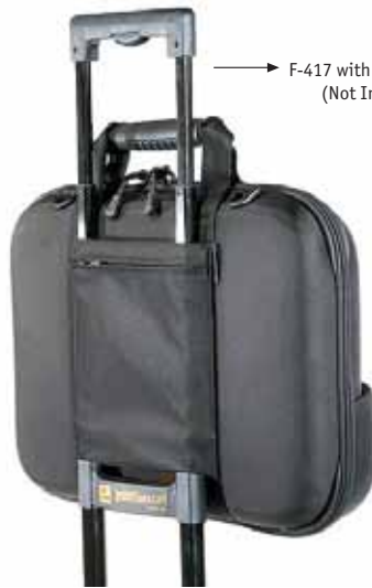
→ F-417 with Insertrolley (Not Included)