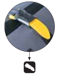
Tail Trap Buckle

The TT Buckle is ergonomically designed for comfort and ease of use. When you push the "Tail" into the "Trap" you can adjust the closing of the bag or vest as tight or loose as required.