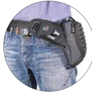
S-312 in Ziv Koren's Hip Sling Configuration