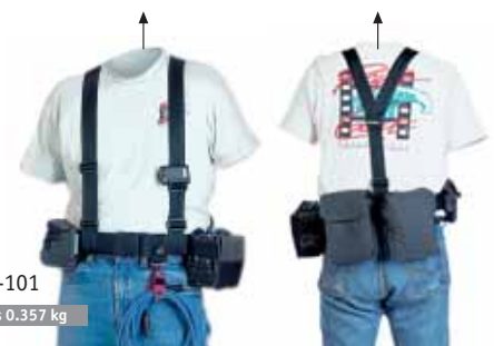
MPS - Front